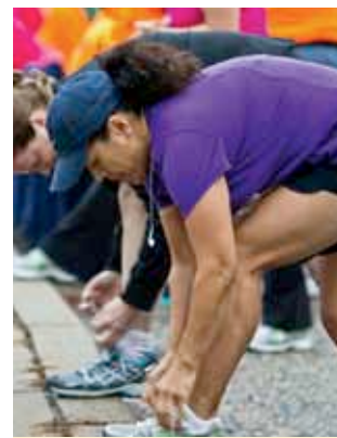
Runners prepare at the starting line.