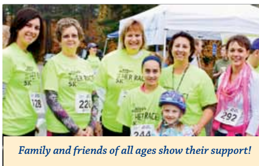
Family and friends of all ages show their support!

As the holidays approach, we at Abby's House are grateful for the community that surrounds and supports us. Because of you, we can continue to extend hospitality to everyone who comes to our door. We hope that the smell of holiday meals and the colorful glow of holiday lights will make all of us feel a little more at home this season, give us a little more peace, and a real sense of how our mission of hospitality is alive each and every day. *