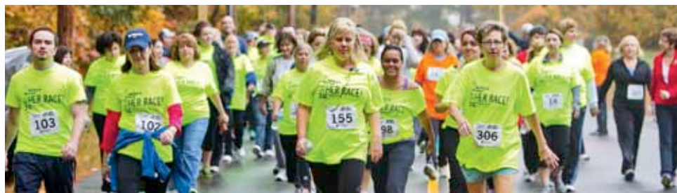
345 people participated in the 3rd Annual HipHipHerRace, helping to raise over $20,000!