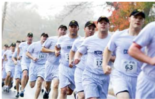
Thank you to the Worcester County Sheriff's Office (BRTA #38) for supporting Abby's House!