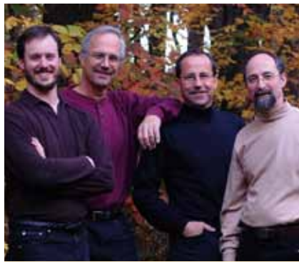
Live bluegrass music by SloGrass

The new roof at 52 High Street has already resulted in significant savings on our energy bills, allowing us to direct additional funds to service. More importantly, replacing the roof preserved 55 units of safe, decent, affordable housing for low-income women. Thank you for making this project a reality! *