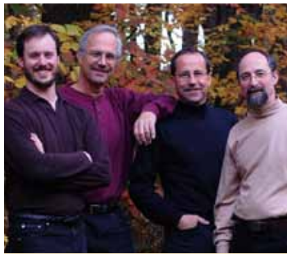
Live bluegrass music by SloGrass

The new roof at 52 High Street has already resulted in significant savings on our energy bills, allowing us to direct additional funds to service. More importantly, replacing the roof preserved 55 units of safe, decent, affordable housing for low-income women. Thank you for making this project a reality! *