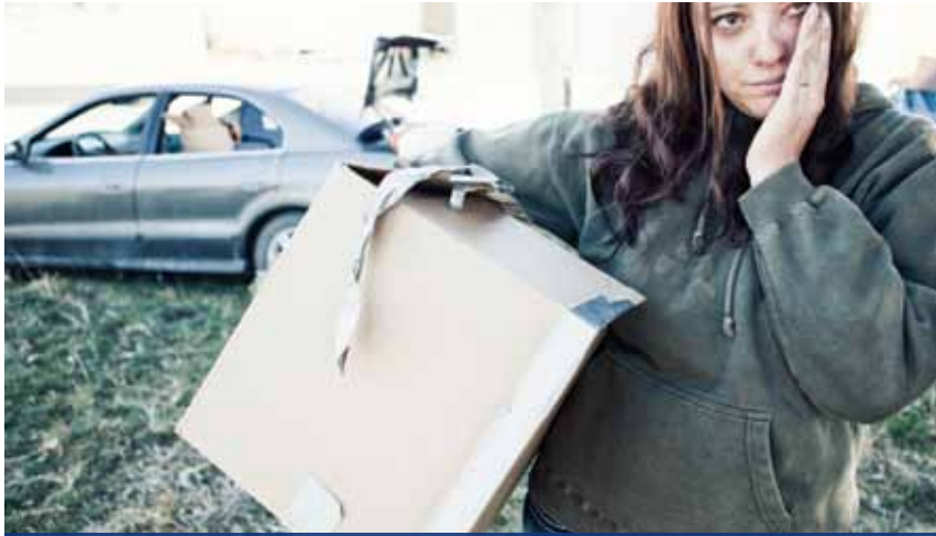
Communities across the nation are facing shortages to meet the increased need for affordable housing.