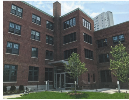
New, accessible entrance into 52 High Street

Remaining largely unaltered since its creation in the 1920s, this home needed extensive renovations in order to meet the needs of current and future generations.