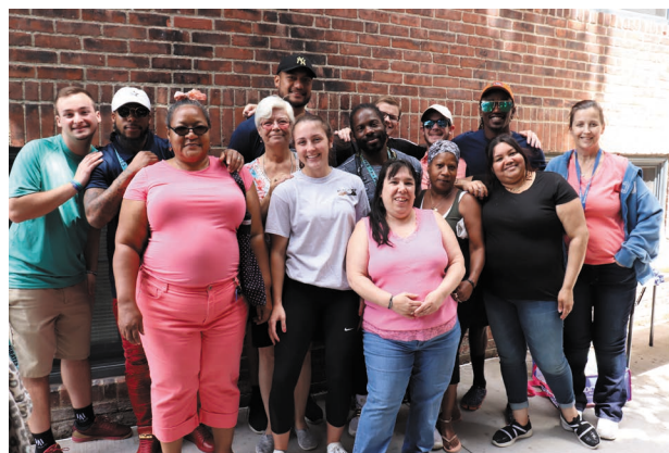
The women of Abby's House celebrate the 4th of July with a cookout with players and staff from the Massachusetts Pirates

"We've seen women move in who were in domestic violence situations, women who could no longer afford where they were living after taking care of sick relatives, and