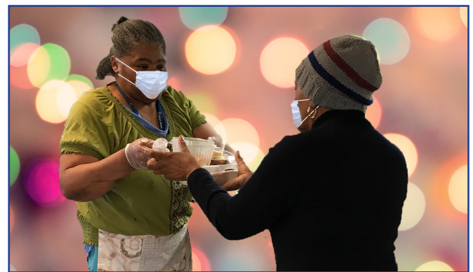
Through your support, women and children continue to be cared for this holiday season and beyond.