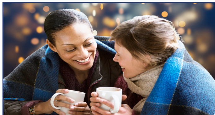
Through your support, the women of Abby's House come together to uplift and strengthen one another.

In the last year and a half, however, we found cracks appearing in our vibrant community as a pandemic impacted lives. We faced a collective loss—loss of our sense of normalcy, loss of our personal connections, and loss of life. We lost beautiful souls in the past year, women and supporters who were part of the mosaic of the Abby's House community.