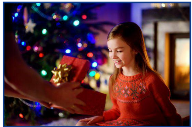
You make the season brighter for women and children who come through the doors of Abby’s House.