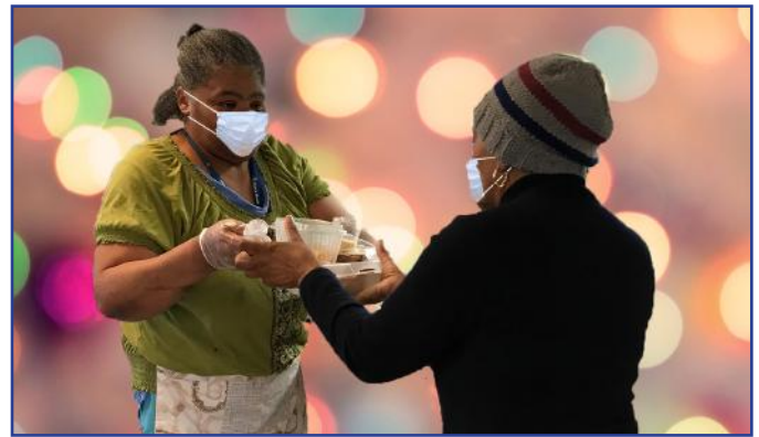
Through your support, women and children continue to be cared for this holiday season and beyond.