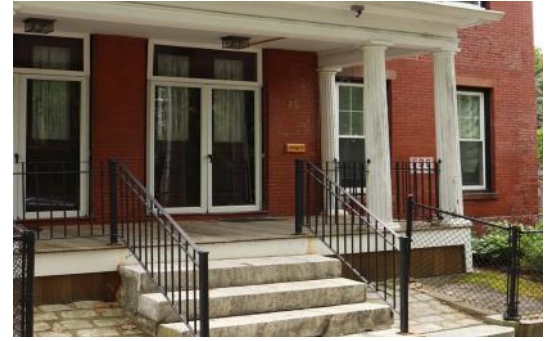
Opening in 1976, the Crown Street shelter has served women, with or without children, for 47 years.

When Abby's House first opened in June 1976, the volunteers in the shelter knew women and children would be coming through the doors for many different reasons. One of the first reports in March of 1979 describes the women who stayed in the shelter in its first 3 years – 351 individual women and 148 children. These women included “142 transient women” who “wandered the city seeking employment, residence, or a better world...102 women who experienced alcoholism at some point in their lives causing a loss in finances...an unknown number of women with mental health issues who were displaced by the closing of local hospitals...59 physically abused or in danger of abuse...6 victims of sexual assault who were brought by police or local centers... and women whose stories were not identified and who came and went quietly.”